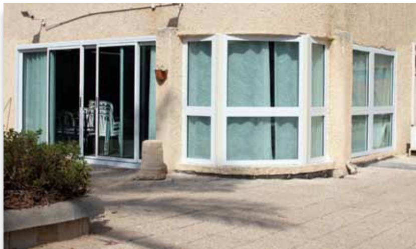
Secure Community Center in Nir Am.

For the residents of Kibbutz Nir Am, an Israeli farming community bordering the Gaza Strip, this is reality. We at Hope for Israel could not sit back and do nothing. Inquiring about what the residents needed most in the midst of the turmoil, we discovered that there was no place for the community at large to meet securely. So, we renovated and secured a community center that can withstand rocket attacks. What this means for the community