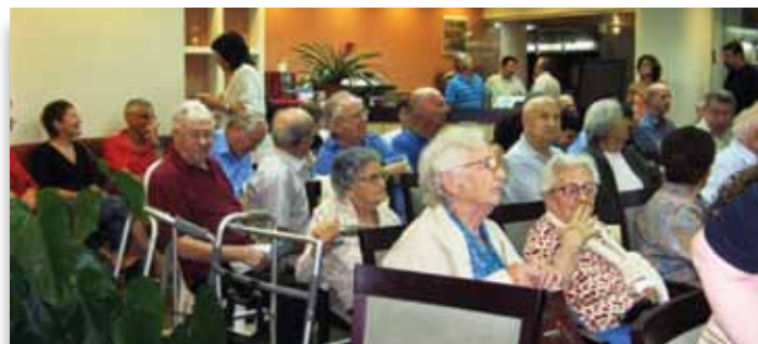
The elderly in the Nir Am Community Center.

is that they now have a safe place to convene together, to fellowship, to support each other, and to have a place to take their minds off the constant threat of attack, if even for a few moments. What we didn’t anticipate was that it would become the main heart of the community during this past war with Hamas, as well as a “war room” where the heads of the kibbutz would meet to determine steps to take to keep the residents safe. This is how we are bringing hope to these people, extending His hand of mercy to bless them.