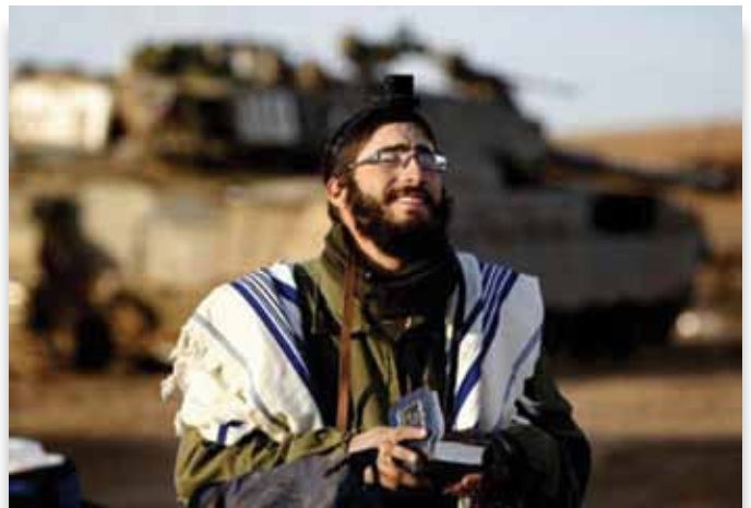
Israeli soldier in Gaza.

being lovers of Yeshua and lovers of the truth. If He is truly our first love, He will share with us His abundant love for the nations and for the “least of these of [His] brethren”, the Jews (Matthew 25:31-45). If we are undone by experiencing the greatest love the world has ever known, the love of Yeshua, if