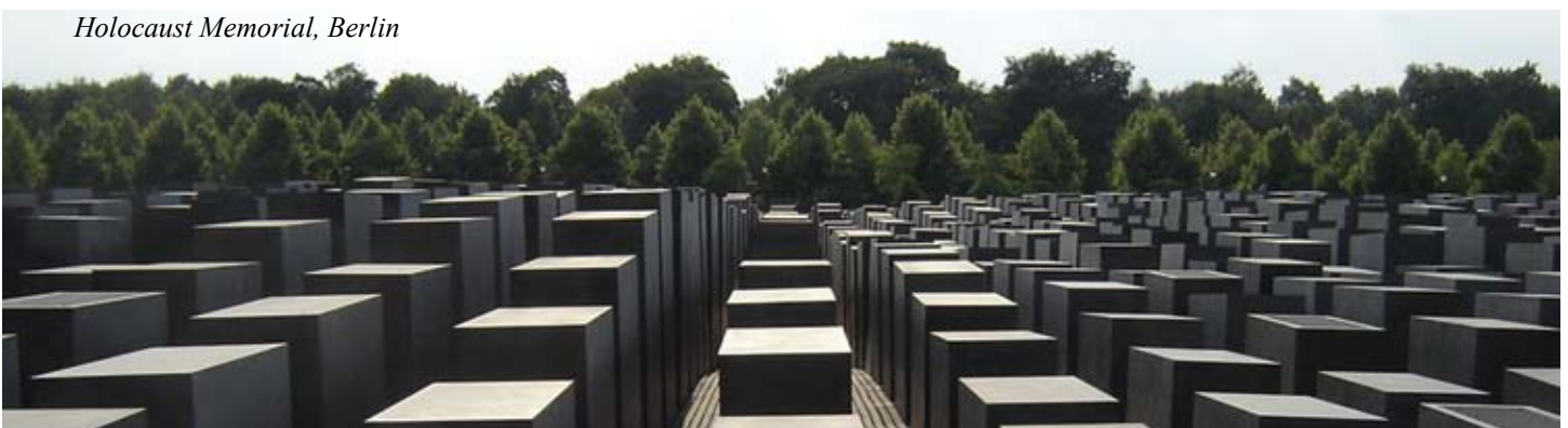
Holocaust Memorial, Berlin

And what other nation can be the picture of pain and suffering like the Jewish nation? God is trying to make a point to all of us through what He is doing for the Jewish nation. God took a literal valley of dry bones, “the whole house of Israel”, and brought them back to life in our time, in direct accordance to His promise: “I will gather you from the peoples, assemble you from the countries where you have been scattered, and I will give you the land of Israel.” (Ezekiel 11:10). However, as the Lord showed the prophet Ezekiel, there was a body of flesh and blood, but there was no breath in it, which means, it was not yet fully alive. Though many Christians throughout the world have recognized the re-establishment of the state of Israel as a prophetic “super-sign” to signal an end times generation and enthusiastically support Israel, sometimes an important factor gets overlooked: God was by no means done when He re-established the house of Jacob in the land of Israel. Something even greater was in store.